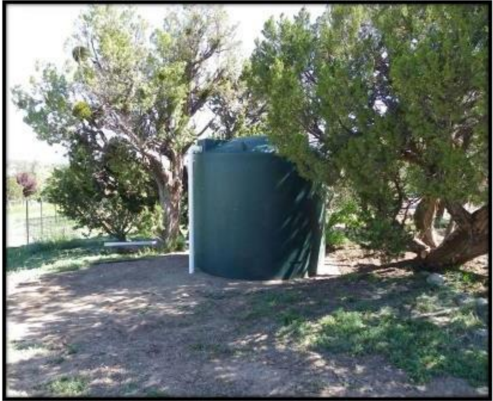
Rainwater Harvesting Project