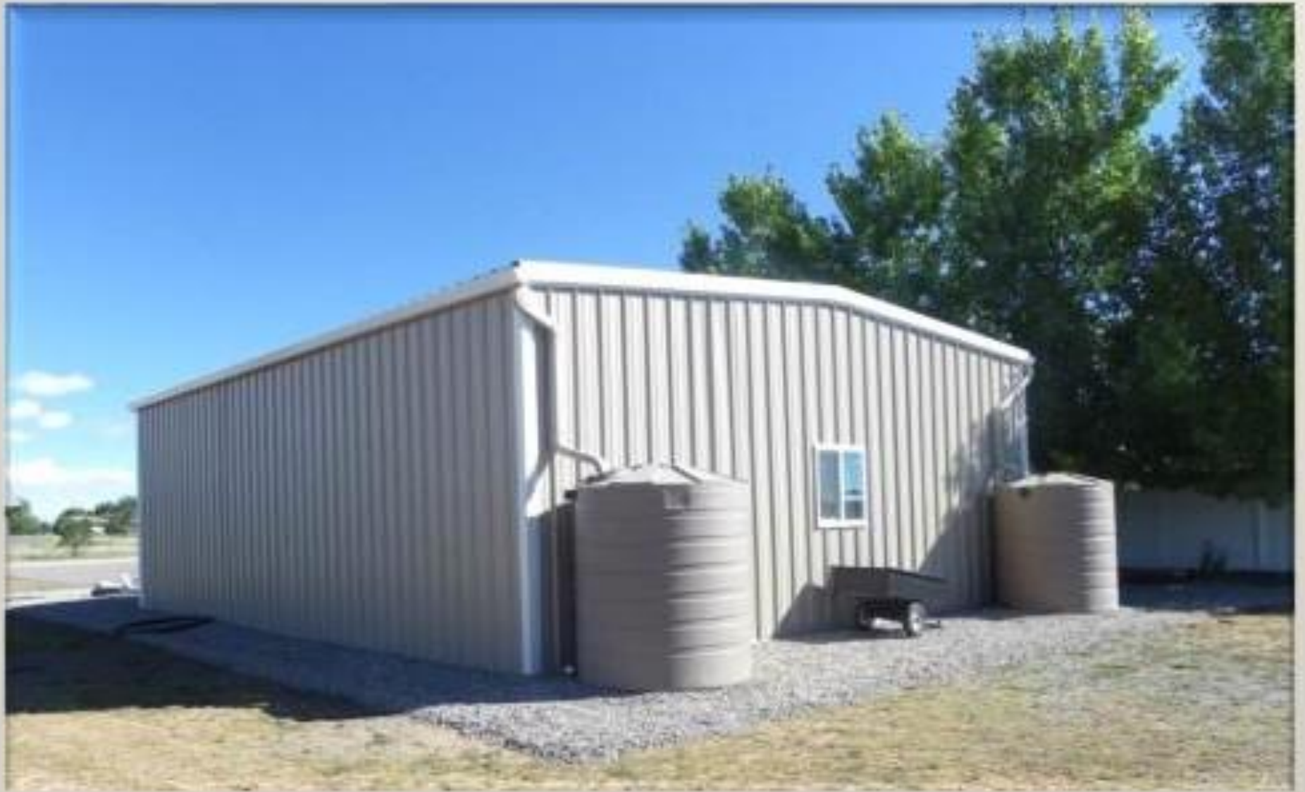
Rainwater Harvesting Project