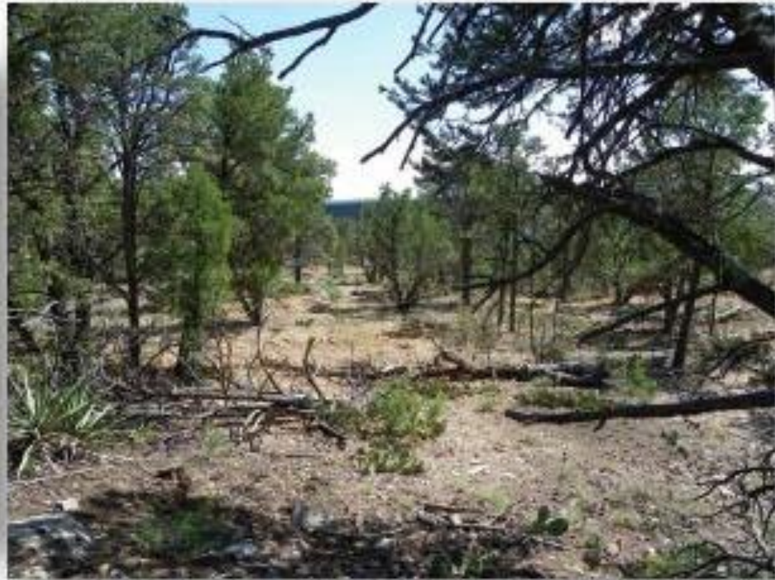
Before Treatment and After Treatment